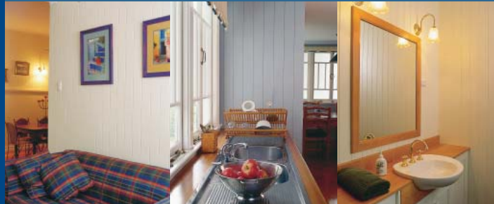
walls & ceilings